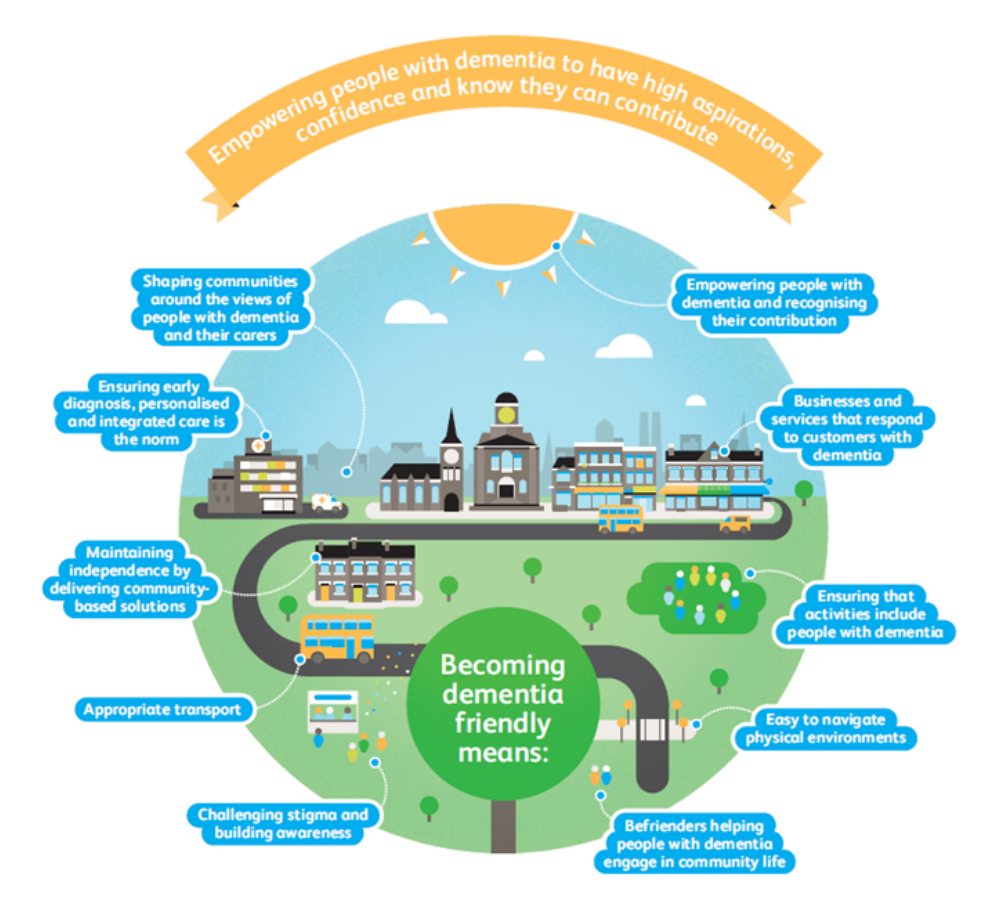
Figure 4. Source: Alzheimer's Society, 'Building Dementia-friendly communities: A priority for everyone, August 2013.